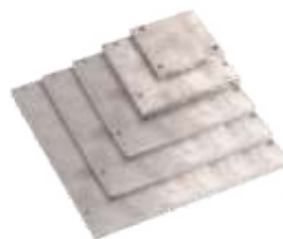
Electron ray standard lead Block