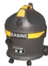
Industrial Cleaner (need to be purchased additionally)